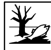
Dangerous for the Environment