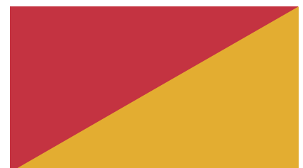
Safety Red / Yellow *▲

The colours shown may differ from the original product due to reprographic and technological media variations. The same colour in different products may also vary due to the composition and texture of the final finish. If colour and final aesthetics are of concern, please contact us to request an actual sample of the colour and system required.