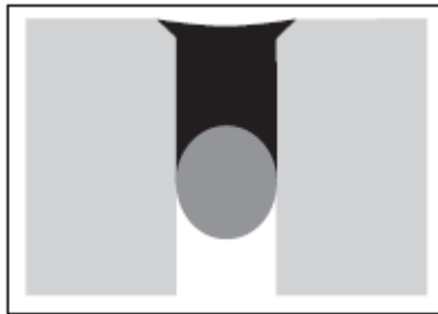
The flush joint design rules out trip hazards and dirt traps.

Backing: Use only closed cell, polyethylene foam backing rods.